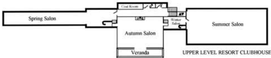
UPPER LEVEL RESORT CLUBHOUSE